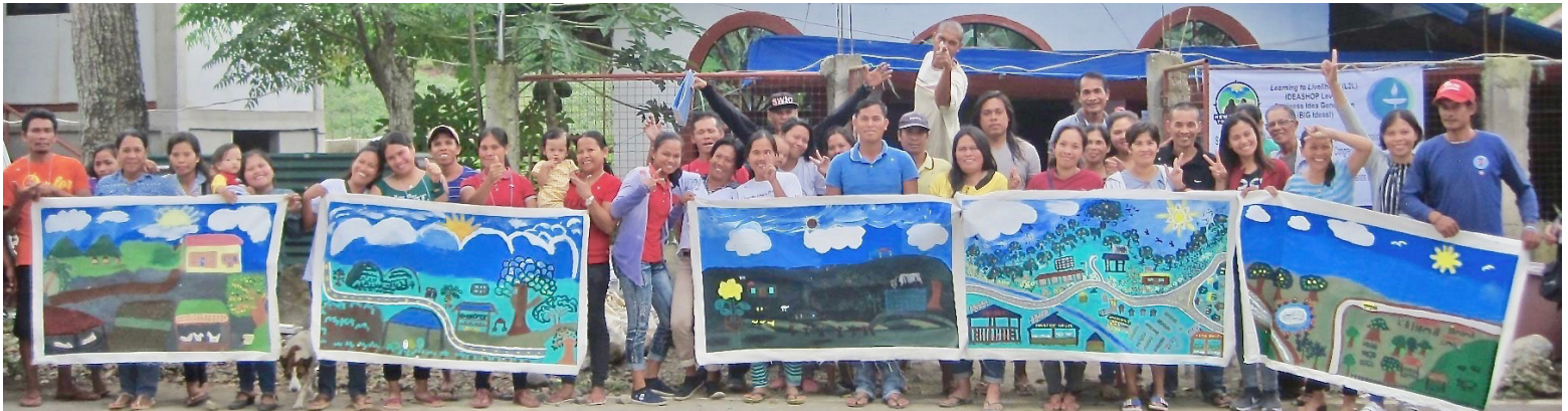
Envisioning the future: Participant teams produce murals, imagining how their communities will benefit once their livelihood opportunities become reality. The exercise encourages creativity, risk-taking, and group bonding - all important to entrepreneurial success.

At a September 2019 information session, we shared New Pathways' purpose and approach to knowledge-based entrepreneurship, and listened to potential participants' ideas about livelihoods they would like to explore. Based on what we learned, we carried out profitability assessments to determine which of these would be best suited for presentation at L2L Level 1: Business Idea Generation (BIG ideas) held in February 10-13, 2020. Based on individual interviews at program's end, the majority selected Livestock Integrated Food Enterprise (LIFE) as their preferred livelihood. A smaller group chose hog-raising. Upcoming next are L2L Level 2: Livelihood Skills Training for both groups, lasting several months; and Level 3: Business Skills Training, culminating in participants' graduation; leading to Level 4: Business Start-Up for which we will provide start-up capital as an equity investment grant in the form of poultry and livestock, plants and equipment, materials and infrastructure.