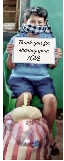
Member, Cal-igang Handicraft-Making Assoc. Samar Island