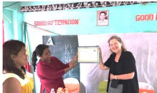
Like Whole Foods, NEW Pathways’ motto is that our animals will have only one bad day, and we will make it as humane as possible for over 1,000 hogs/month.

Photos left to right: 1) Chris receives certificate; 2) Stunner presented to City Mayor in May 2018.