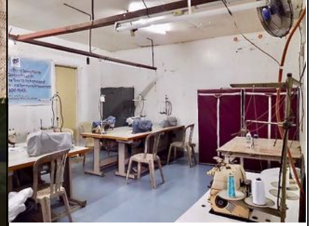
Photos clockwise from left: 1) Children's welcome; 2-3) BDATPEACE officers providing reports on the status of luxury gown rentals and NEW Pathways' orders; 4) New garment center location with wardrobes for gowns; 5) Beaded scarves and satin bags; 6) "Be Confidently Beautiful" banner; 7) Group photo.