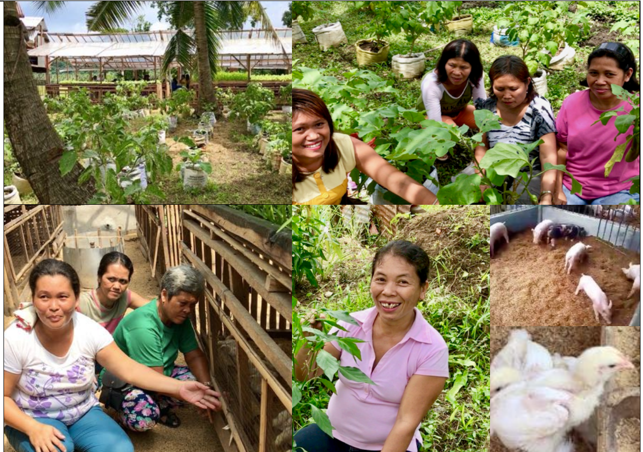
Children at the School of Agricultural and Environmental Sciences (SAGES) in Wisconsin, and student members of the Rowan University Philippine American Coalition provided funding for the first two Life food houses.

1) View of 2 LIFE food houses; 2) Women with eggplants; 3) Piglets; 4) Chicks; 5) Woman with hot pepper plant; 6) Women with young chickens in run under greenhouse.