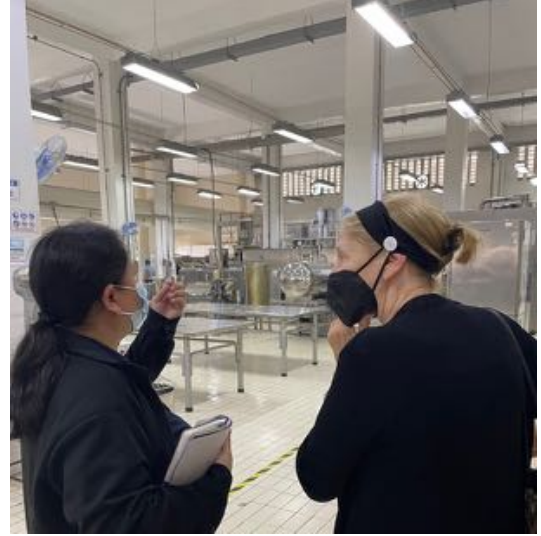
Feb 10: Heading home